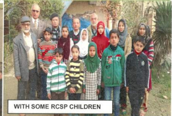
WITH SOME RCSP CHILDREN