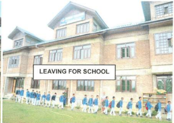
LEAVING FOR SCHOOL