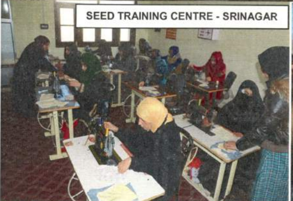
SEED TRAINING CENTRE - SRINAGAR