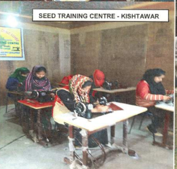
SEED TRAINING CENTRE - KISHTAWAR