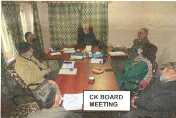
CK BOARD MEETING