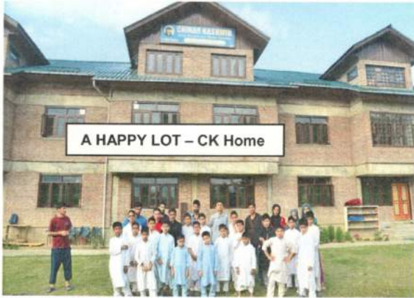
A HAPPY LOT – CK Home